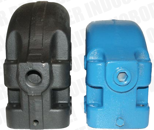
CRU98126 / BARCR20-98126 4" OEM Riser Crusader XL Series 6 3/4" High 24 lbs $149.00 USD

Above is a front view comparison of both sizes of riser side by side.